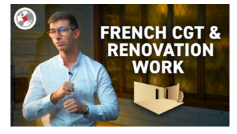
The Deduction of Renovation Costs