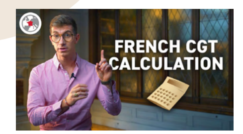
The Calculation of Capital Gains on Real Estate